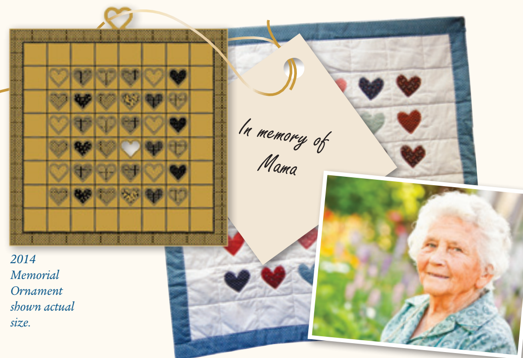
2014 Memorial Ornament shown actual size.

Learn more about Holidays for Hospice at carepartnersfoundation.org or call 828-277-4815.