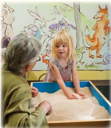
Children enjoy using the sand tray to tell stories that reflect their feelings.